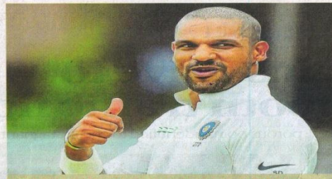
Shikhar Dhawan sparkles P16